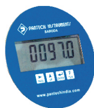
(PCB format, 4.5 digit)