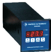
( 48*48, 4 digit )