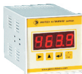
( 72*72, 4 digit )