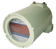
( FLP enclosure )