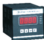
( 96*96, 4 digit )