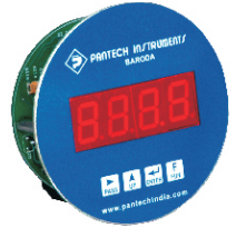
( PCB format, 4 digit )