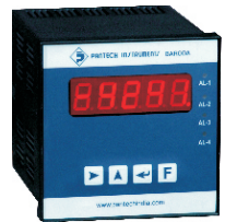
( 96*96 type )