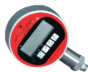
( Numeric LCD display )

24 V DC (22.5 to 28.0 V DC) or Battery operated ( rechargeable battery )